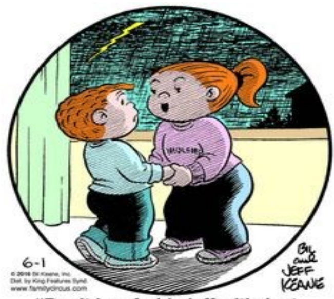
"Don't be afraid, Jeffy. It's just God givin' us a little thunder and enlightening."