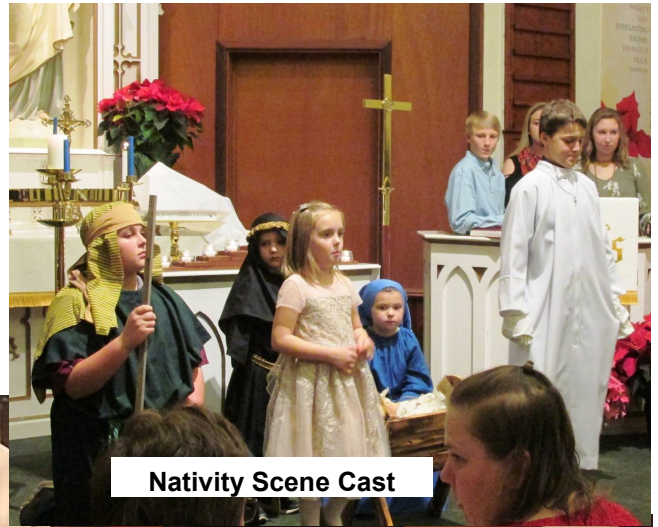
Nativity Scene Cast